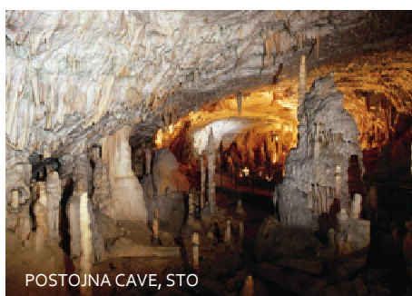
POSTOJNA CAVE, STO