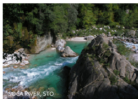
SOCA RIVER, STO