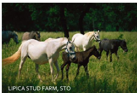
LIPICA STUD FARM, STO